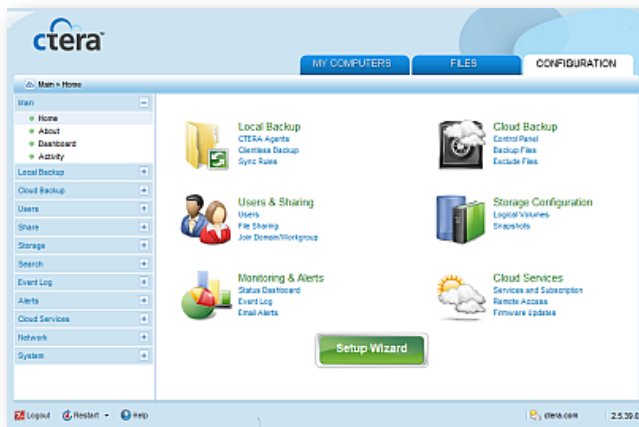
CTERA's easy-to-use, browser-based user interface

Install the C400 or C800 on your local network for instant hybrid local & cloud backup and disaster recovery